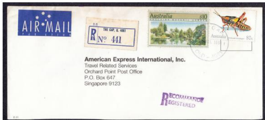
Figs 6 & 7 (top)