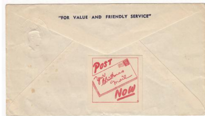
Figures 1 - 4