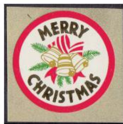
Left L-R Figures 31, 32 & 33

of products. The third label on the 1985 confirms this, with its margin inscription: POSTPAK CHRISTMAS STICKERS MS921 (OCT 85) .