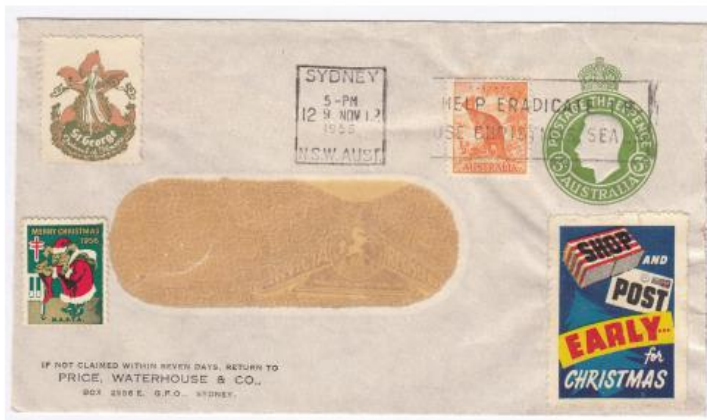
Top L-R Figures 5, 6 & 9 Above Figure 8 Below L-R Figures 7, 10 & 11

Further information on the Shop and the vari-