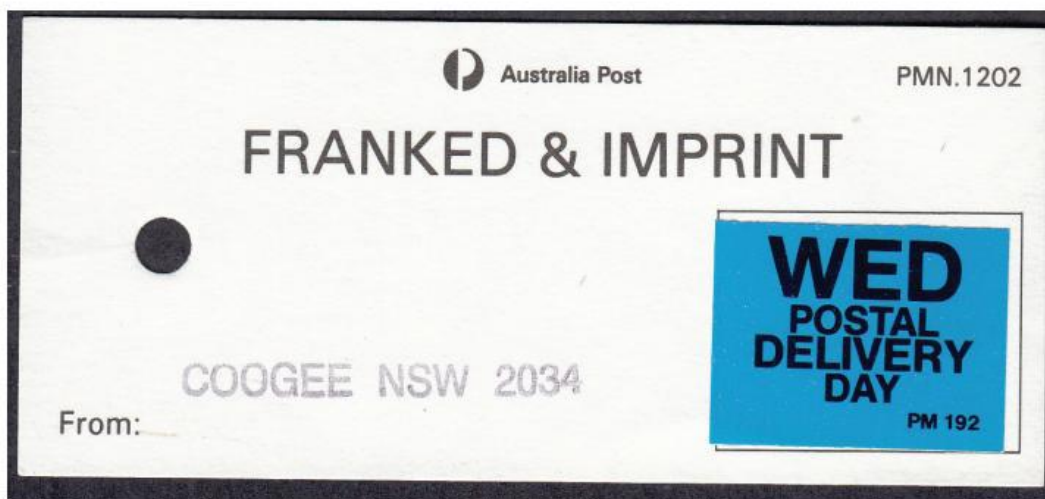
Left : Figure 4 Above : Figure 5 Below : Figure 6

Post logo, the 122mm x 40mm label features the text: Australia Post / BY HAND ONLY / FRAGILE / DO NOT BAG / Australia Post.