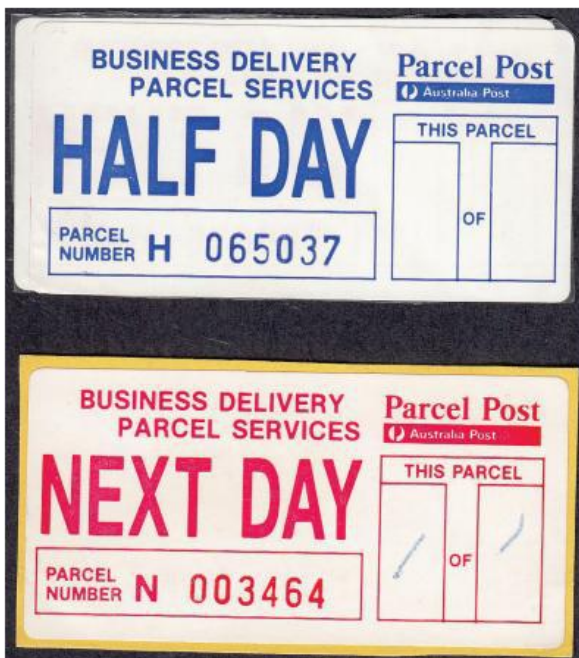
Left : Figure 1 Above : Figure 2 Below : Figure 3

The two Business Delivery Parcel Services cinderellas illustrated in Figure 1 were used in conjunction with an earlier issued Business Delivery Service (South Australia) label. These two labels, issued in 1994, are scarce. Each measures 70mm x 35mm and is imperforate with rounded corners. The top label is coloured blue and white; the bottom label is coloured red and white. The top label features the text: BUSINESS DELIVERY / PARCEL SERVICES / HALF DAY / PARCEL