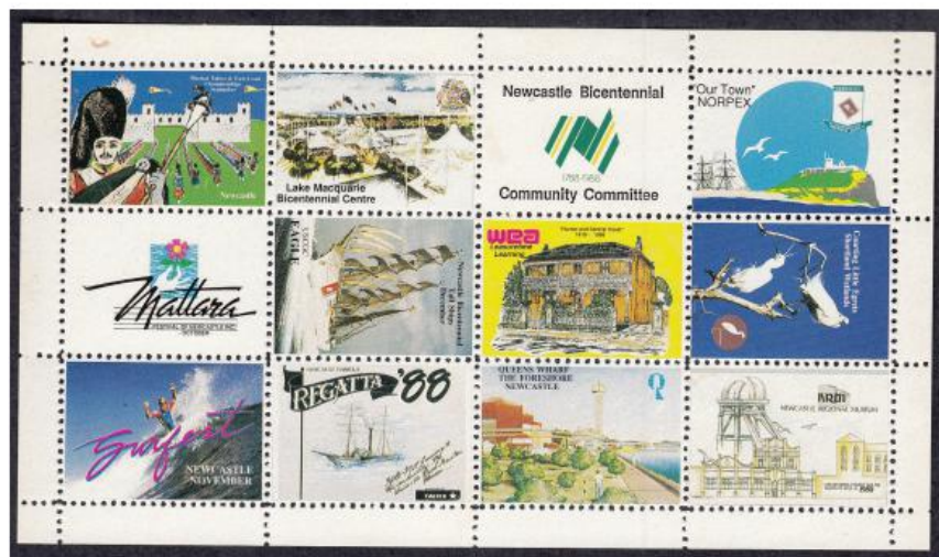
Top L-R : Figures 12 & 14 Left : Figure 13

image in Figure 12 should be considered a more accurate representation. This sheet also references the importance of industry and commerce to Newcastle's self image, whilst its imposing size attempts to add further gravitas to the classical iconography. Dimensions 78mm x 60mm.