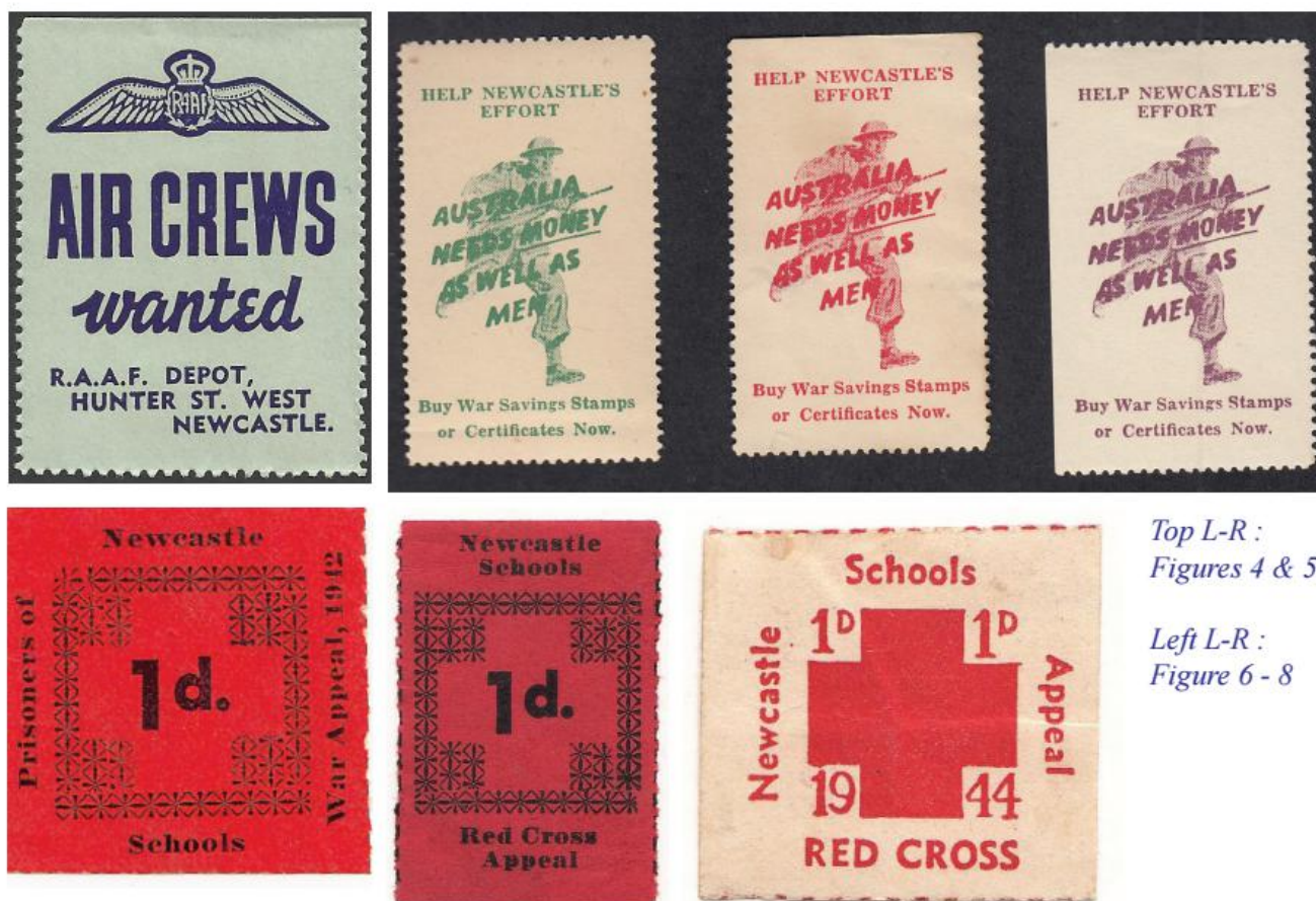
Top L-R : Figures 4 & 5