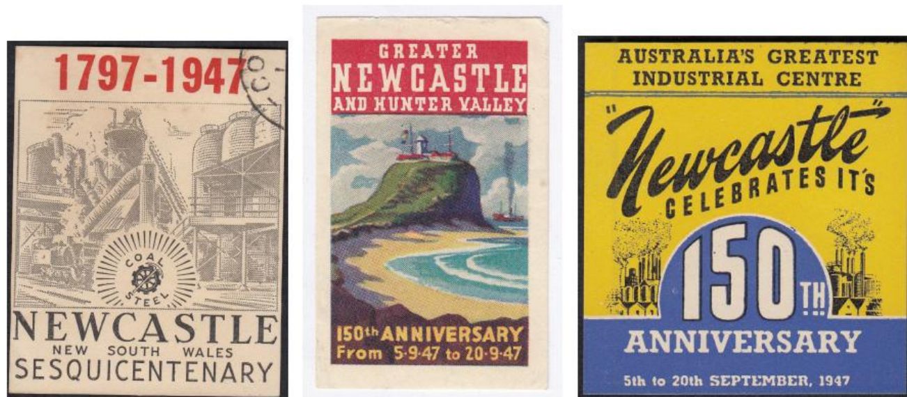
L-R: Figures 9 - 11

A major philatelic exhibition was also a feature of the 1947 sesquicentenary celebrations, held in Tyrrell Hall and run by the Newcastle Philatelic Society. The rather grand classically themed Souvenir Sheet at Figure 12 was produced to promote the exhibition and is often encountered on cover. In common with Figure 11 this stamp features an image of Nobby's Beach, Head and Lighthouse however, despite show-