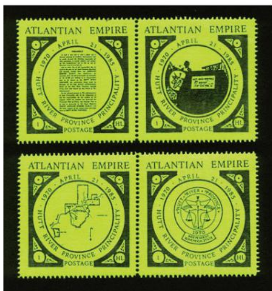
Above :Figure 9 Above right : Figure 10 Right :Figure 11

different ‘scenes’ from Hutt River. Each label also includes the text: ATLANTIAN EMPIRE / HUTT RIVER PROVINCE PRINCIPALITY / 1970 APRIL 21 1985 / 1HL POSTAGE