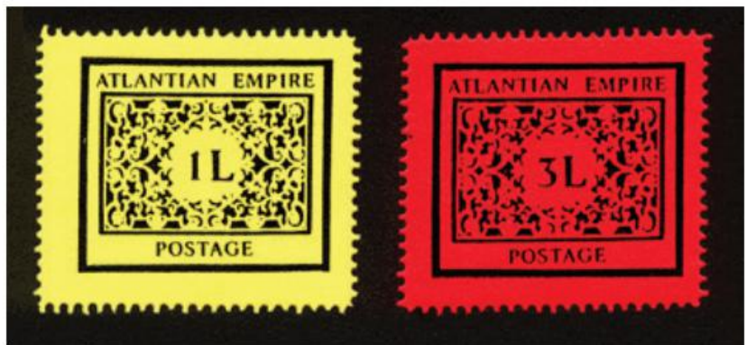
Left : Figure 5 Above : Figure 6

A silhouette of the Emperor features centrally on the stamp; an example of the cinderella is illustrated in Figure 5.