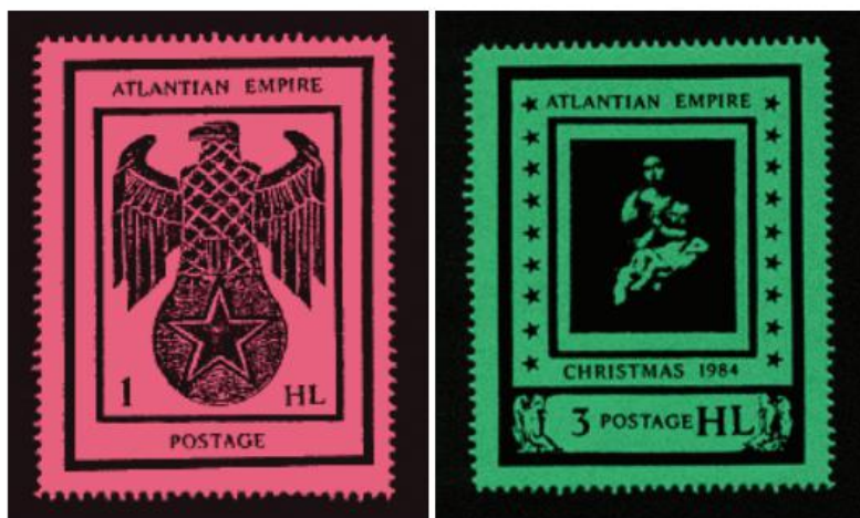
Figures 7 & 8

To commemorate the 15 th anniversary of the formation of the Hutt River Principality, four different square stamps, in two different pairs, were issued on 21 April 1985. Each label is perforated and features