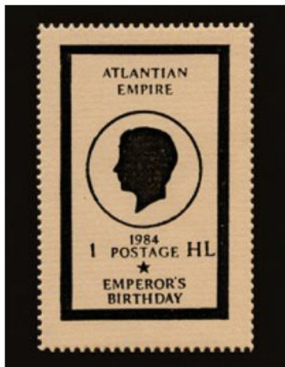
Figure 3. A few months later, on 7 December 1983, five more stamps were issued with the same design alongside different postage rates and colours. These are illustrated collectively in Figure 4. The 7 December releases also included a pair of minisheets for two of the labels with Emperor's Birthday overprints.