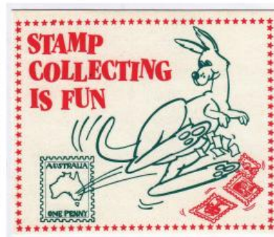
Far Left Figure 9 Left Top Figure 10 Left Figure 11 Above Figure 12

AUSTRALIAN STAMPS and I'M AN AUSTRALIAN STAMP COLLECTOR! Many thanks to Mr. Noel Almeida for identifying these as Australia Post issues that were offered free to Stamp Bulletin readers.