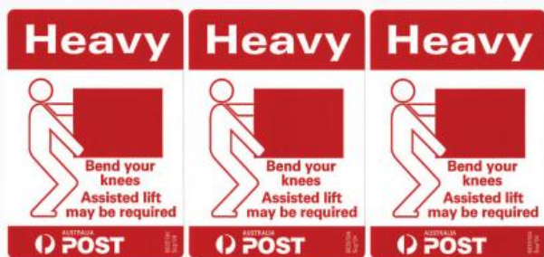
Left Top Figures 4 & 5 Left Bottom Figure 7 Above Figure 6 Right Figure 8