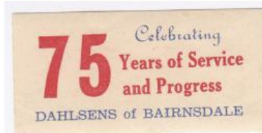
Top : Figure 7