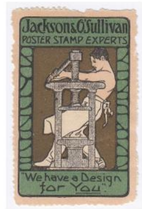
Above L-R : Figure 10 & Figure 12