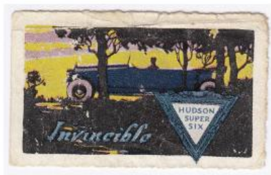
Top L-R Figure 14 & Figure 15

75 th anniversary. Imperforate and coloured red, blue and cream, it measures 51mm x 25mm. The cinderella features the text: Celebrating 75 Years of Service and Progress / DAHLENS of BAIRNSDALE . Further information about this label and its date of issue is required.