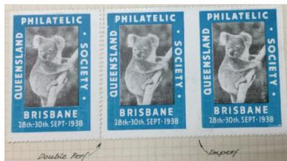
Below L-R Figure 16 & Figure 17