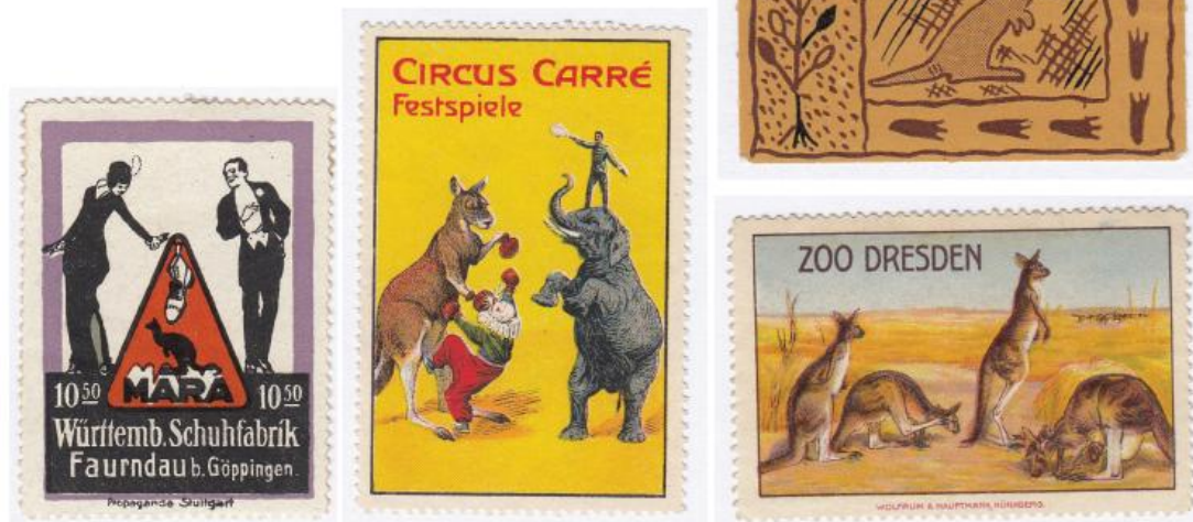
Figures 9 to 12

Figure 12 The cinderella featured in Figure 12 measures 60mm x 40mm, is perforated 11½ on all sides, and is multicoloured. It features four kangaroos and a joey in its frame, as well as several others in the receding background. The translated text reads: In frame: ZOO DRESDEN . Bottom: WOLFRUM & HAUPTMANN, NÜRNBERG . Dresden Zoo, which opened