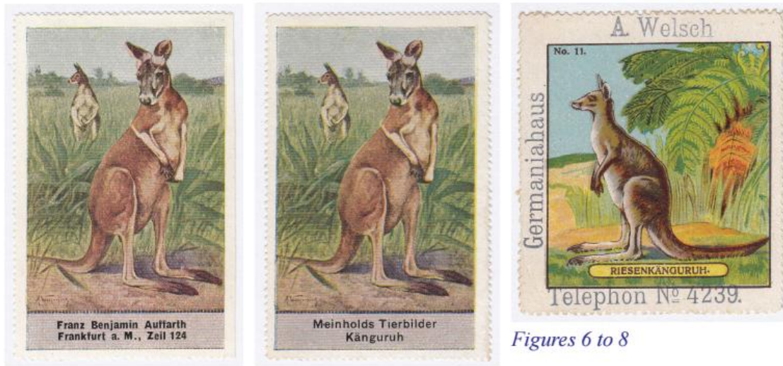
Figures 6 to 8

Bottom (in frame): Red Kangaroo . Bottom: Telephone No. 4239 .