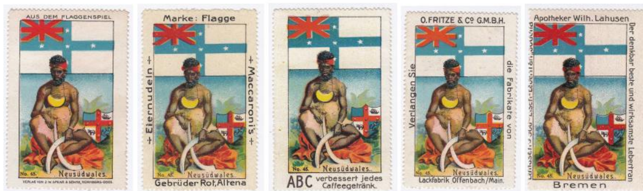
Figures 1 to 5

Figure 8 The cinderella featured in Figure 8 measures 54mm x 61mm, is perforated 11 on all sides, and is multicoloured. Like the labels illustrated in Figures 6 and 7, it too features a red kangaroo in open plains. Translated details of the text are as follows: Top: A. Welsch . Top (in frame): No. 11 . Left: German House .