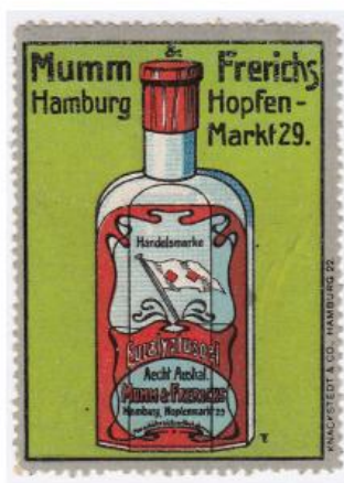
Figures 13 to 15

Figure 16 The label illustrated in Figure 16 features a variety of the New South Wales federation flag. It measures 49mm x 58mm and is multicoloured.