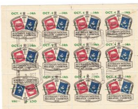
Top to bottom : Figure 7, Figure 8, Figure 9, Figure 10, Above right : Figure 11