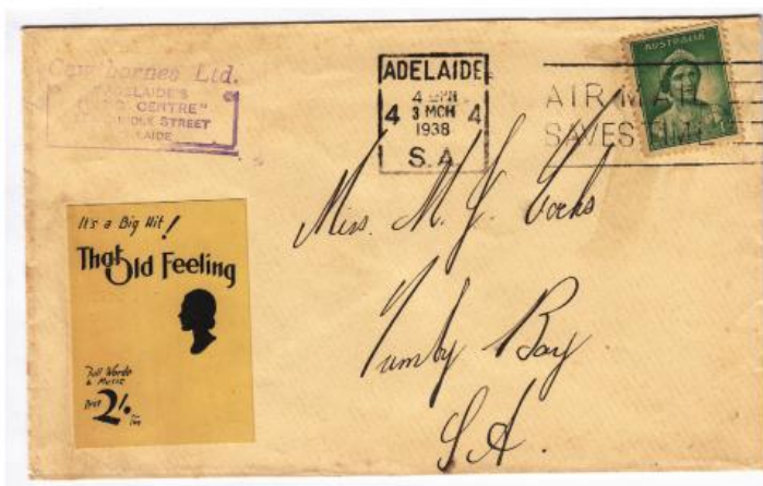
Top to bottom : Figures 4, 5 & 6

The label also contains the contents for the volume, namely 12 different songs, including the wonderfully named The Beer Barrel Polka . Interestingly, it also lists the additional price of 2/6 for postage to New Zealand, reflecting an increase in international postage. The label dates to the early 1940s and is affixed to an Adelaide cover postmarked 21 August