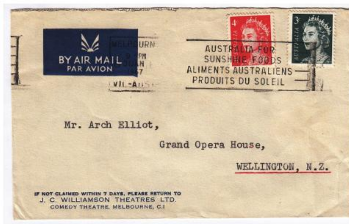
Top to bottom : Figures 1, 2 & 3

sented in Figure 2. Coloured blue, red, white and black, and imperforate, it measures 45mm x 65mm and features the text: Albert's DANCE FOLIO NUMBER 14 / WITH SYMBOLS FOR UKULELE PIANO ACCORDEON BANJO & GUITAR / PRICE, 2/2 POSTED