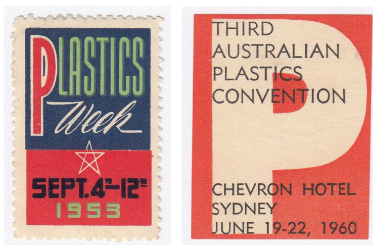
Figures 2 & 3

A 22mm x 36mm cinderella was issued to help celebrate the 1953 Plastics Week, as illustrated in Figure 2. Multicoloured and perforated 11 on all four sides, it features the text: PLASTICS Week / SEPT. 4 TH - 12 TH 1953