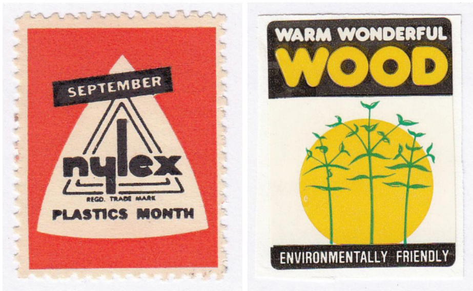
Figures 4 & 5

The first annual Australian Plastics Convention was held at the Chevron Hotel, in Sydney, from 19 to 22 June, 1958. To help commemorate the convention's third event, in 1960, a 40mm x 50mm cinderella label was issued, as illustrated in Figure 3. Coloured orange-red, black and cream, it is imperforate on all four sides and features the text: THE AUSTRALIAN PLASTICS CONVENTION / CHEVRON HOTEL SYDNEY / JUNE 19 – 22, 1960