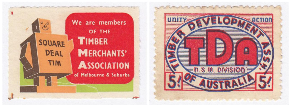
Figures 7 & 8

The small and elusive timber-related label illustrated in Figure 11 measures 35mm x 28mm and is perforated 10 on all three sides. It features the text TIMBER TIME , and the clock at its centre presents a time of