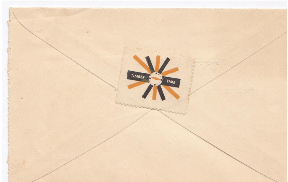
Figures 10 & 11

approximately 2:46. The cinderella is affixed to the reverse of a cover postmarked 20 November 1958, addressed to the Forests Commission of Victoria.