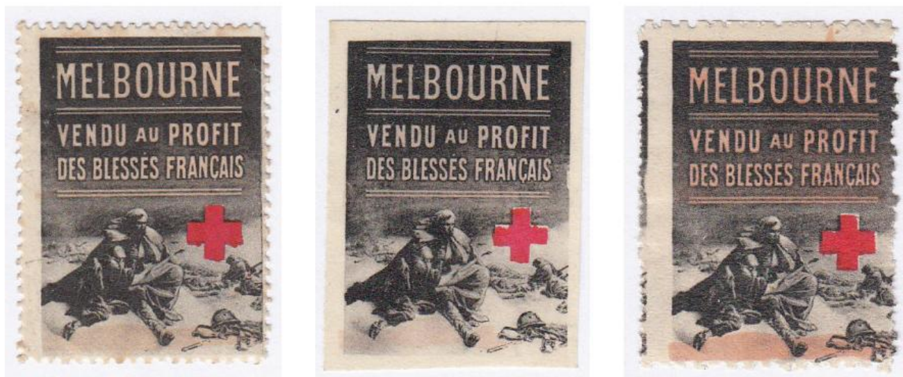
L-R Figures 5, 6 & 7

AU PROFIT DES BLESSES FRANÇAIS / MELBOURNE. The English translation reads: SOLD FOR THE BENEFIT OF THE WOUNDED FRENCH. The 1916 label features a dominate central Red Cross draped with the French and Australian flags. The bottom left of the cinderella also features the initials of the label's designer, G. Chanorier. In Volume III, the label is given the catalogue reference 30.1. Figure 2 illustrates the imperforate variety of the label. The Melbourne Type I is also known to exist in two black and white proof versions. One example, also drawn from Volume III, is illustrated in Figure 3 and measures 50mm x 70mm. It is reproduced with permission from Charles Kiddle.