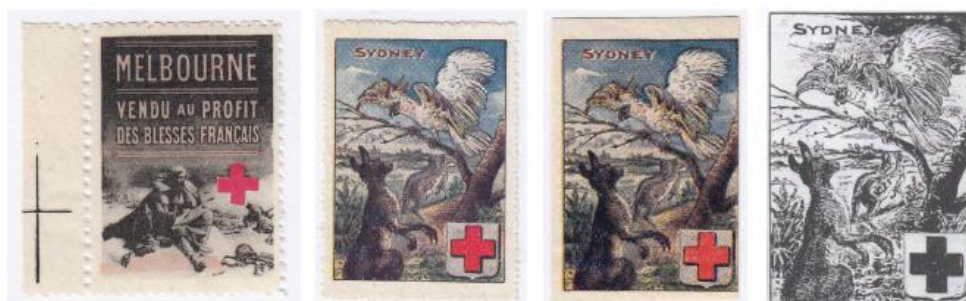
L-R Figures 11, 12, 13 & 14

ed essay is also known, with a photocopy of this scarce item illustrated in Figure 14.