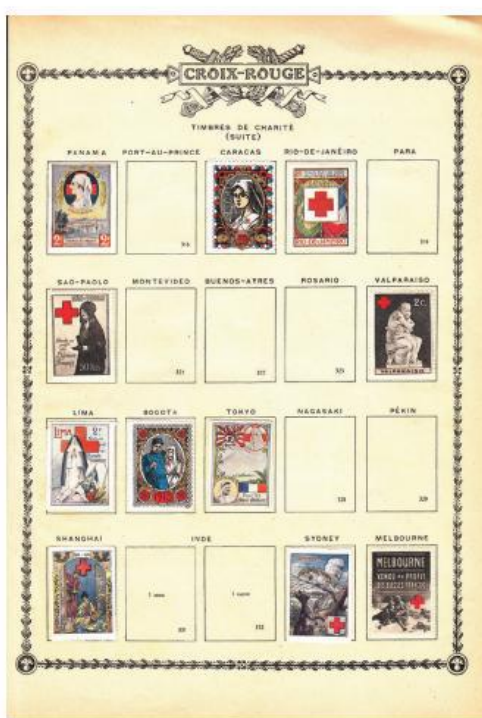
L-R Figures 15 & 16