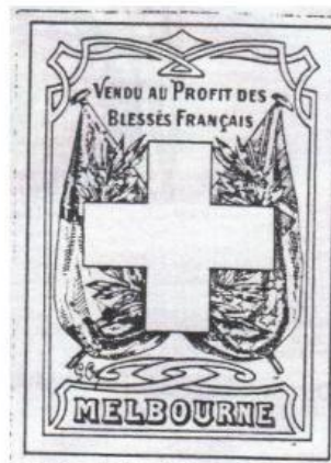
L-R Figures 1, 2 & 3