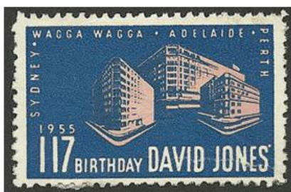
Below : Figure 4