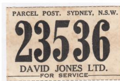
Left : Figure 2 Left below : Figure 3

The cinderella label illustrated in Figure 3 is provided courtesy of Dr. Ron Lafreniere of Canada. The label was issued in 1955 to celebrate David Jones' 117 th birthday. It features images of its buildings in Sydney, Adelaide and Perth. The cinderella is blue, pale red and white and